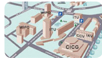
Geneva - world capital of diplomacy

Based in the heart of the most active center for multilateral diplomacy, Geneva is host to over 250 NGOs, 168 foreign states, and has been hosting international organizations for over 100 years. Organizations such as the United Nations office at Geneva (UNOG), the International Labor Organization, the World Meteorological Organization (WMO), the World Health Organization (WHO), the International Committee of the Red Cross and the World Trade Organization (WTO) have a seat in Geneva, with over 40, 000 international diplomats and civil servants working in this international setting. Not only is Geneva the center for diplomacy, it is also a welcoming environment of a wide range of cultures, with over 100 nationalities currently living and working in the city.